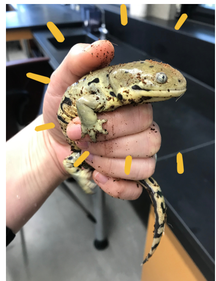
Co-educator Gandl being held up to the camera