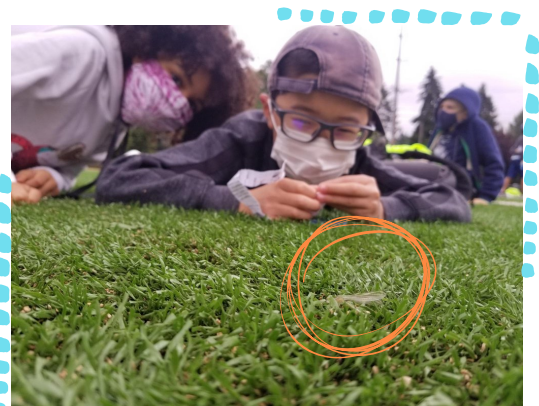
Top left: Campers dissect and articulate bones found in owl pellets Top right: Students test water samples to assess water quality Above: Campers investigate a damselfly

Donate to support our free student programming!